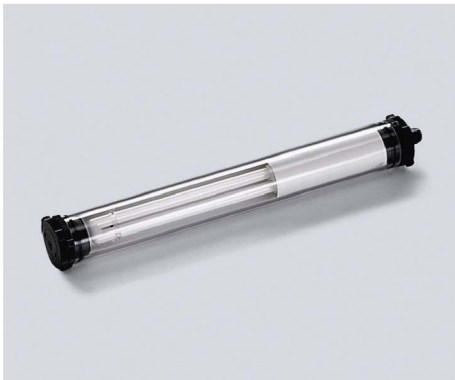
RL70CE - 124